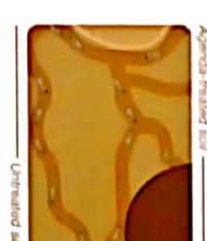
Agenda is passed to other termites in the colony