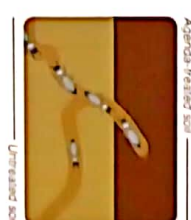
Contaminated termites transfer the active ingredient to uncolonated termites by contact, grooming and exchange of food