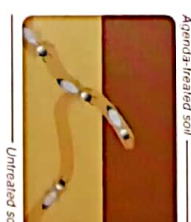
Foraging termites pick up Agenda in two ways: through ingestion, and through contact with the soil