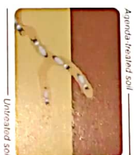
Foraging termites are not repelled, and willingly enter Agenda-treated soil

This colony management effect greatly increases the success of termite control, as termites are eliminated, not just where the soil is treated, but also back their source – the termite colony.